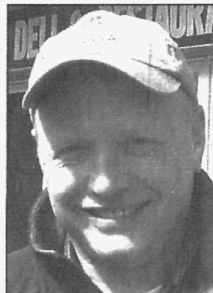
AL SCHWEIKERT High Bridge

"No, we're not accomplishing anything. After three years, we should be done there."