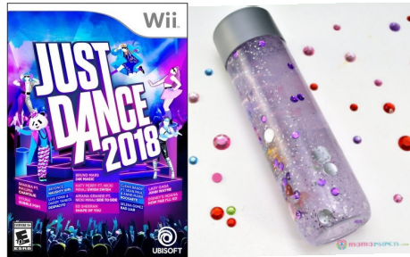
Sensory Crafts & Activities