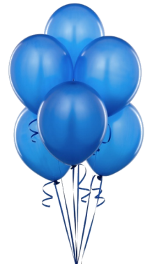
(Indoor) Balloon Release